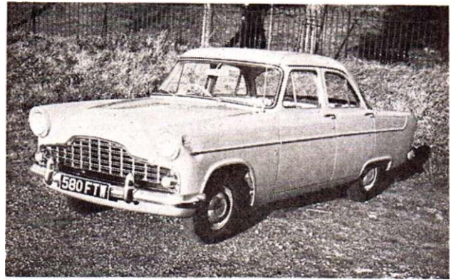
MOST POWERFUL OF THE BRITISH FORDS. —The restyled New Zephyr, which is excellent value for money at £871 7s. inclusive of purchase tax, possessing, as it does, vivid acceleration for a six-seater saloon and 85 m.p.h. maximum speed.

plate, but as no provision is made for holding down this sharp-edged plate with its powerful return spring, nor is the cap integral with the plate, it would seem that in this detail the sales department got the better of the engineers.